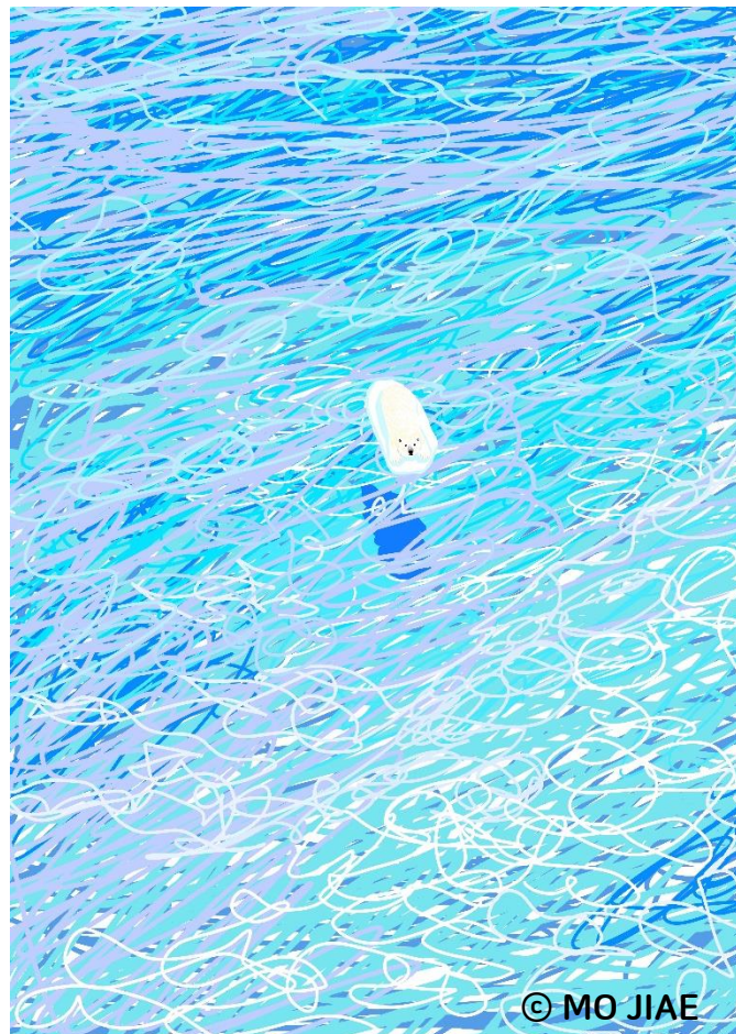
↓ 2023 Summer Festival Poster Concept Image